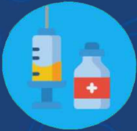
COVID-19 vaccines & boosters